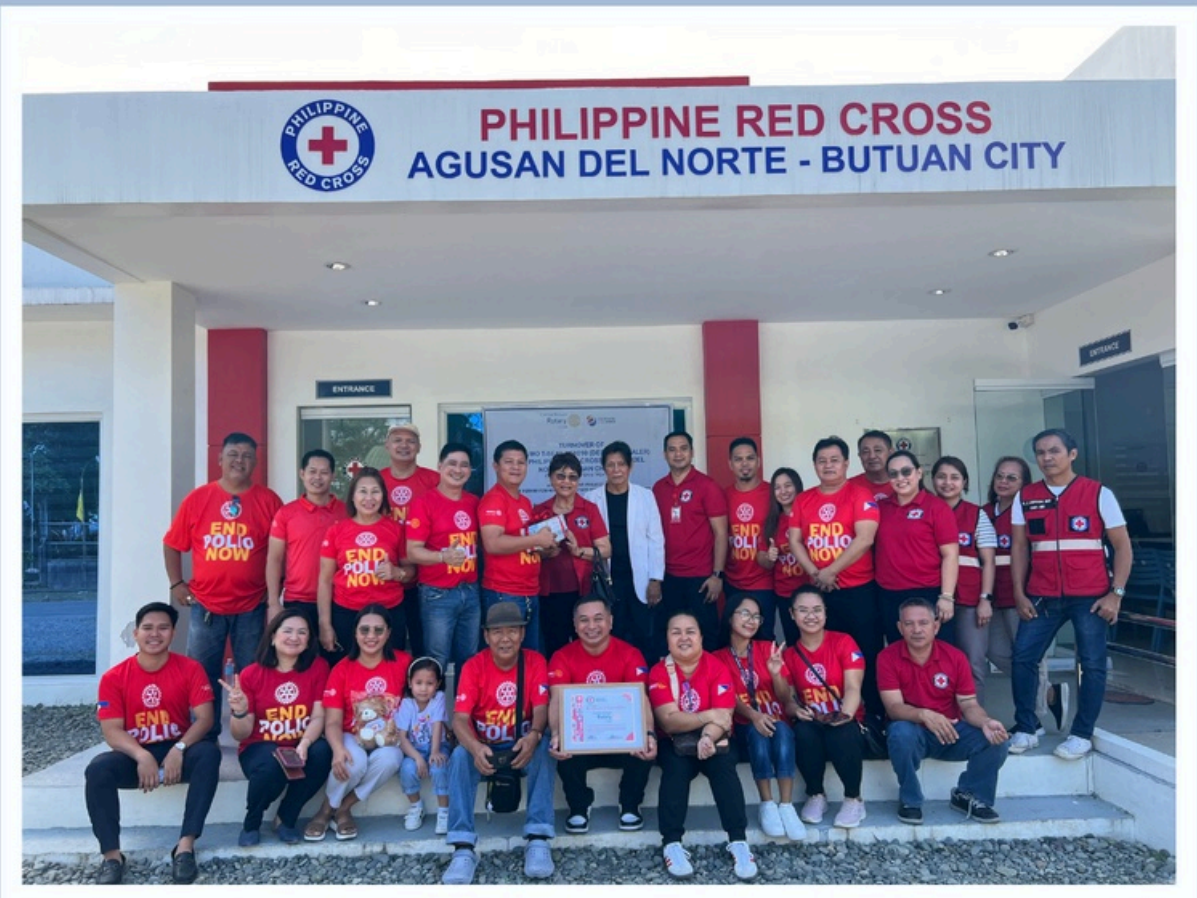
District Grant Project from The Rotary Foundation of Rotary International, District 3860.